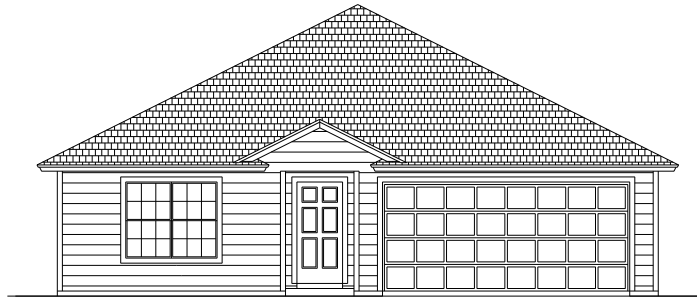
OPTIONAL A 1450-1