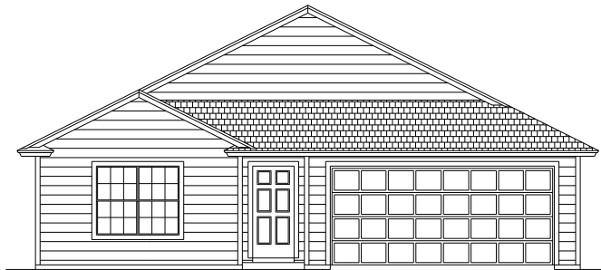
OPTIONAL D 1450-1